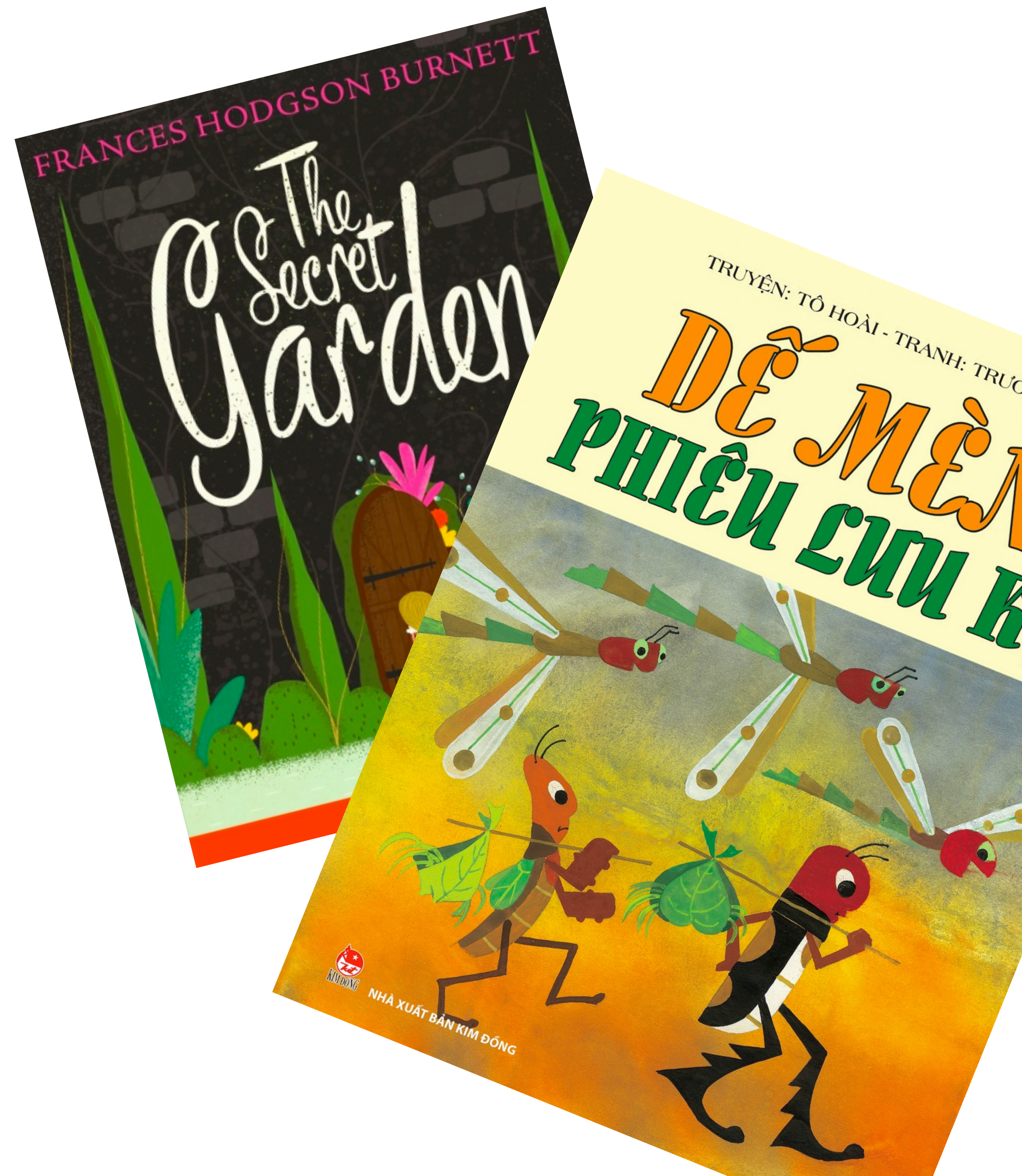
IMAGE: BOOK COVERS OF 'DẾ MÈN PHIÊU LƯU KÝ' (DIARY OF A CRICKET) BY TÔ HOÀI AND 'THE SECRET GARDEN' BY FRANCES HODGSON BURNETT