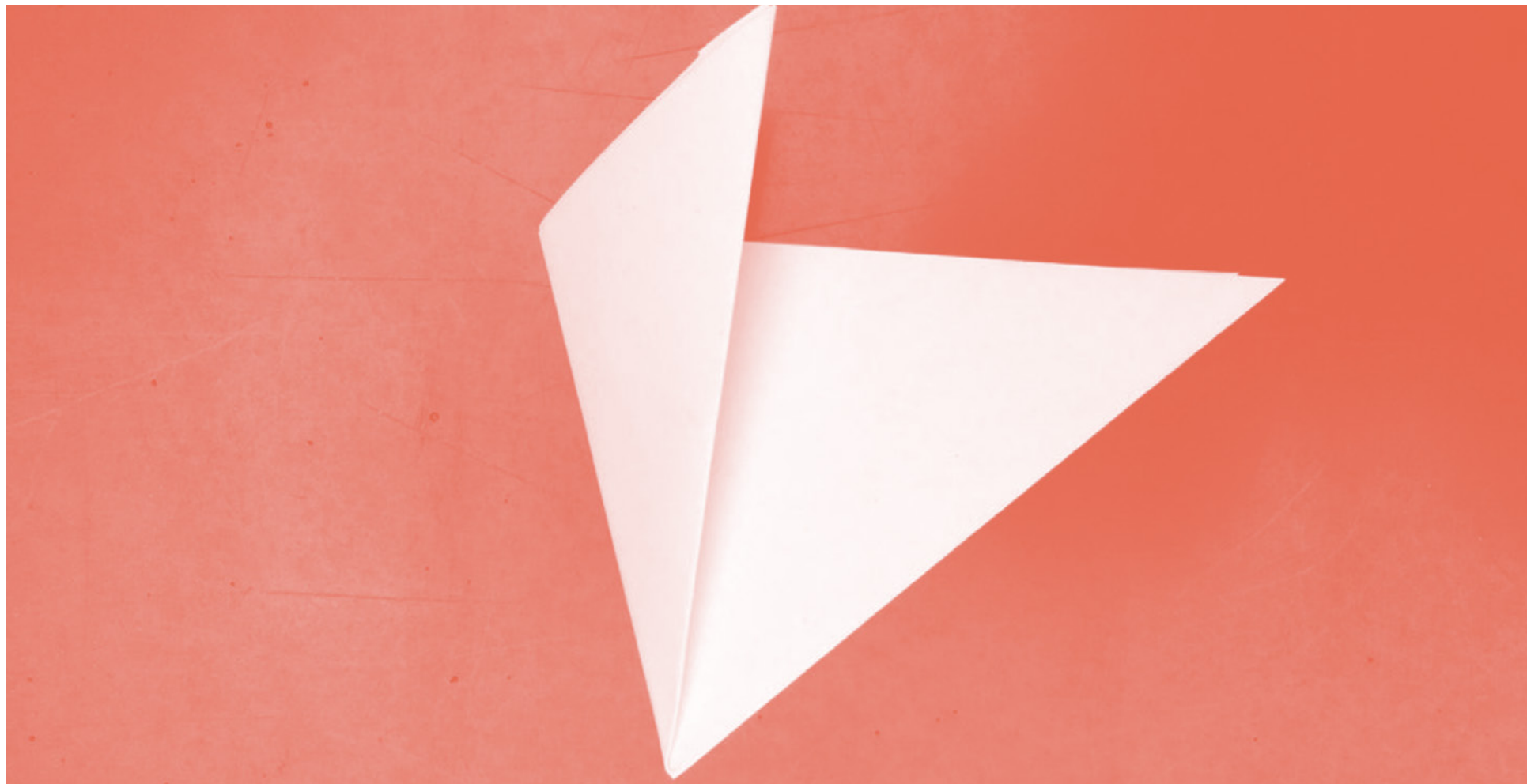
1. Begin to fold the triangle in 3